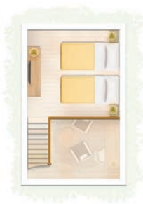
Family Duplex Garden / Family Duplex Sea Facing