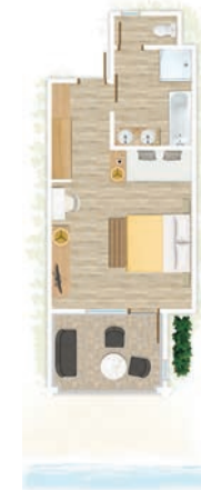
Deluxe Sea Facing Room