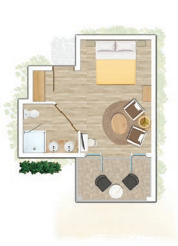
Standard Garden Facing