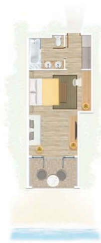
Superior Garden Facing / Superior Sea Facing