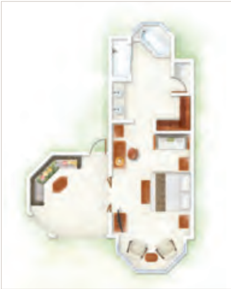
Junior Suite / Junior Suite Beachfront / Zen Suite / Zen Suite Beachfront