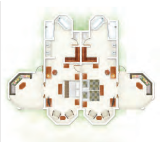
2-Bedroom Family Suite