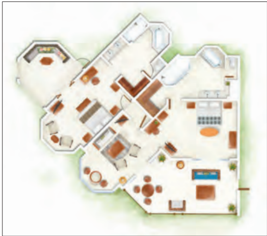
2-Bedroom Luxury Family Suite (Beachfront)