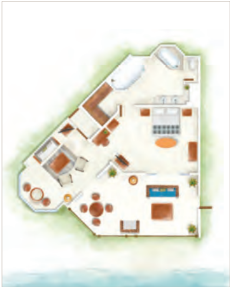
Senior Suite (Beachfront) / Senior Zen Suite (Beachfront)