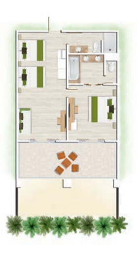
2-Bedroom Garden Facing Apartment