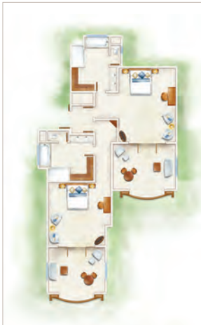
2-Bedroom Tropical Family Suite