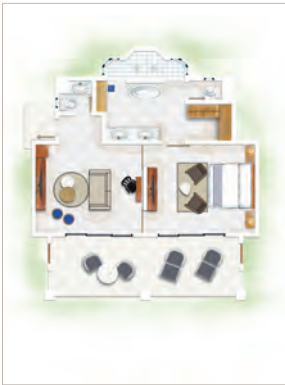
Ocean Suite (Beachfront)