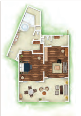
Senior Suite (Beachfront)