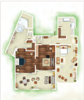
2-Bedroom Luxury Family Suite (Beachfront)