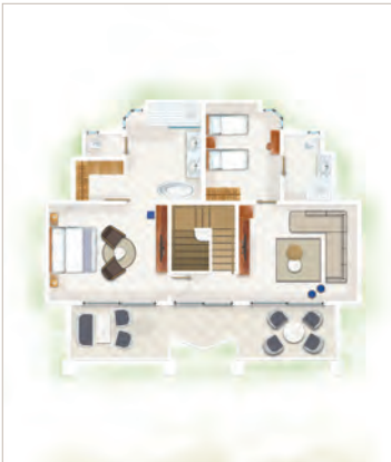
2-Bedroom Luxury Ocean Family Suite (Beachfront)