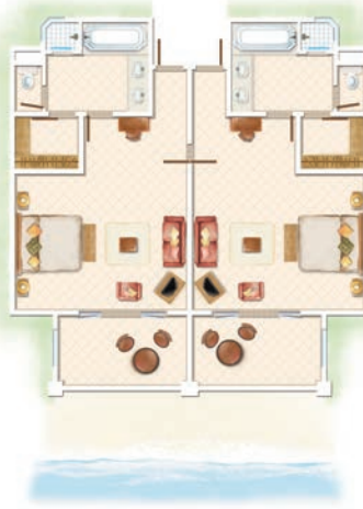
2-Bedroom Deluxe Family Apartment