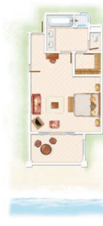
Deluxe Room / Deluxe Ground Floor