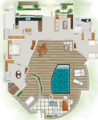
2-Bedroom Pool Villa