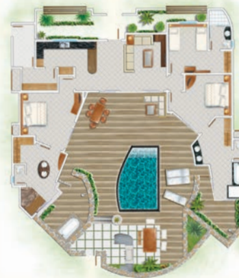
3-Bedroom Pool Villa