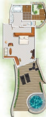
Beachfront Suite with pool