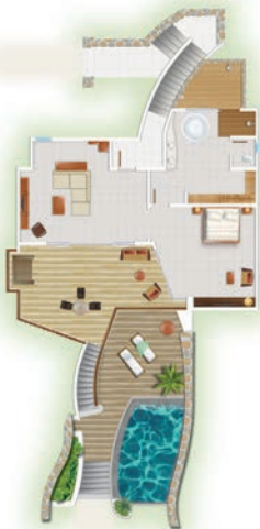
Senior Beachfront Suite with pool