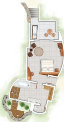
Tropical Junior Suite