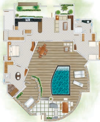
2-Bedroom Pool Villa